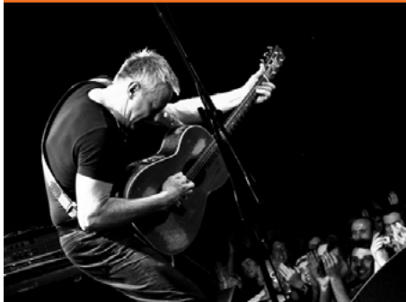
Various performances around the country showcase one of the world's best acoustic guitarists.