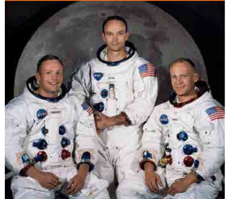
A preview of the upcoming series from American Experience Chasing the Moon is showcased.